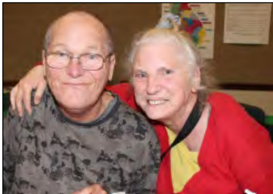
Fun & Fellowship