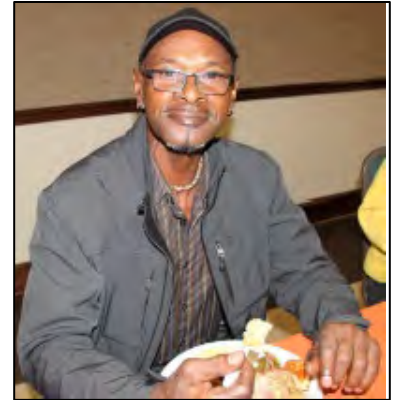
Celebrations & Meals

Since 2014, River Edge Behavioral Health team members have had the opportunity to support River Edge Foundation's philanthropic efforts. In 2019, the campaign was relaunched as the River Edge Achieving Community Health (REACH) campaign. By making a personal gift to River Edge Foundation, team members are sending a clear message to the community that they believe enough in their work and mission to make a personal financial contribution to it. REACH funds are disbursed to annually support individuals served in River Edge programs via a grant application process.